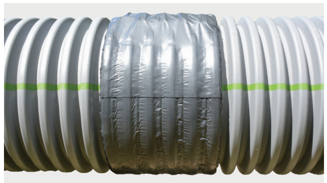
Mar Mac Coupler