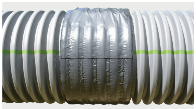
Mar Mac Coupler