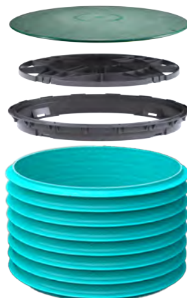
Access Riser with Tank Shield