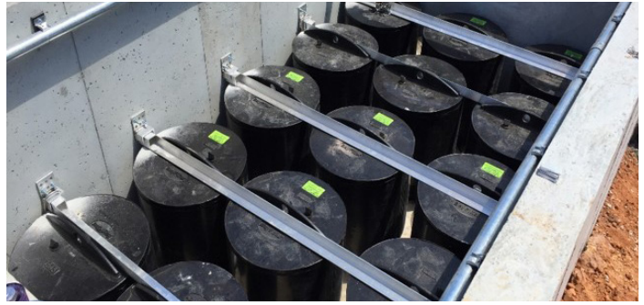
BayFilter Vault Overview