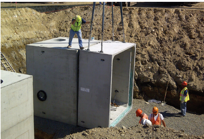
Modular Vault Assembly