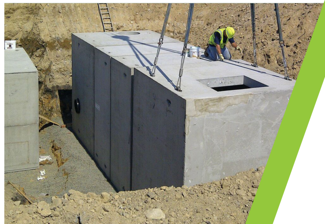
Vault End Section