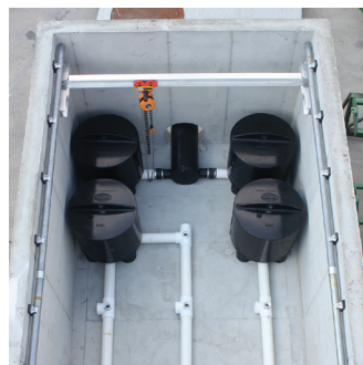
Vault Internal Assembly