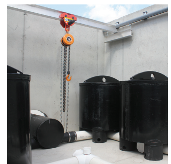
Chain Hoist System