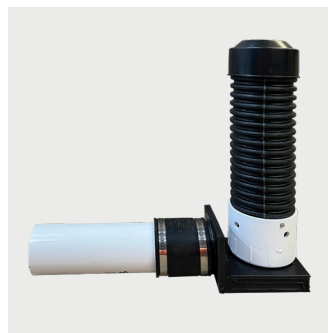
Drain Down Module