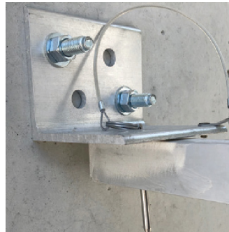
Hold Down Bar Bracket