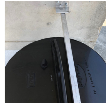
Bar and Bracket