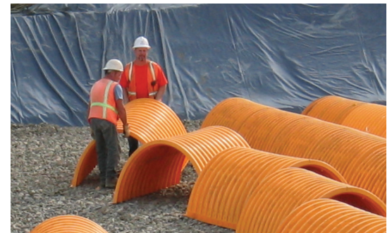
The membrane's flexibility is apparent by visible wrinkling. Flexibility enables the liner to conform to irregularities in the excavation and resist puncture.