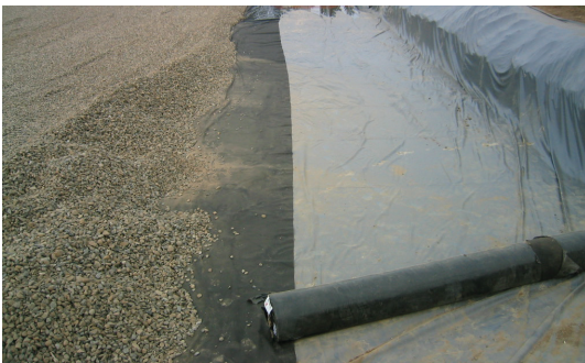
Non-woven fabric is placed over PVC liner before placing angular bedding stone.

Please refer to the StormTech Design Manual for a complete explanation of the StormTech Limited Warranty.