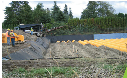
Angular stone backfill is placed around chambers.