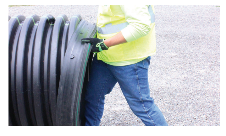
STEP 2 : Slide gasket onto corrugation until it is difficult to stretch (typically ten and two o'clock positions).