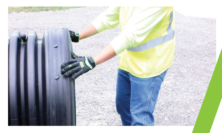
STEP 4 : Check final location of gasket to make sure the gasket is properly positioned completely around the pipe. The green stripe should be positioned on the end of the pipe.