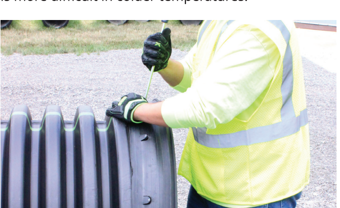
STEP 3 : Use a pry bar to stretch the gasket into place. Use the exclusive pry hole technology built into the 24"-36" (600-900 mm) gasket. When gasket is in final location an audible "snap" will be heard.