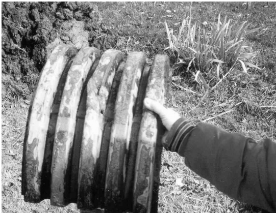
Figure 2: Pipe Cut Location