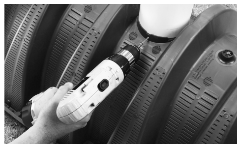
3. Fasten the pipe.

5. A small valve cover box may be used if inspection port is below the desired grade.