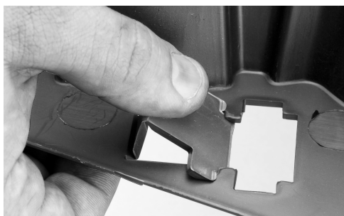
6. Activate StraightLock tabs.