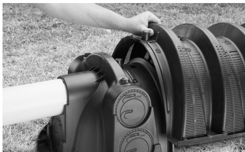
3. Place first chamber onto endcap.

NOTE: Use straight lengths of pipe with the MultiPort Endcap at the trench ends to create fitting-free looped ends.