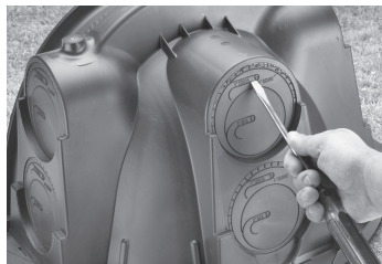
1. Start tear-out seal.