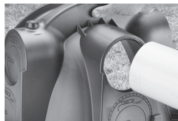
5. Insert inlet pipe.