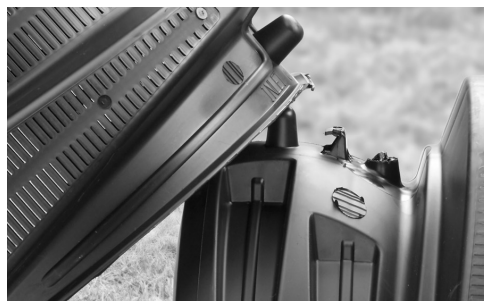
4. Connect the chambers.