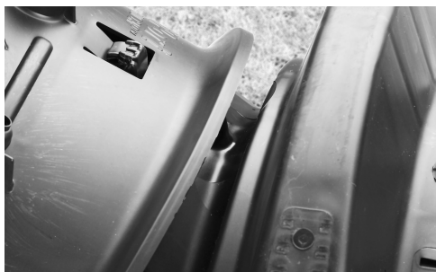
8. Attach endcap to chamber.

9. To ensure structural stability, fill the sidewall area by pulling soil from the sides of the trench with a shovel. Start at the joints where the chambers connect. Continue backfilling the entire sidewall area, making sure the fill covers the louvers.