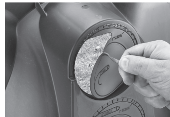
2. Pull tab tear-out seal.