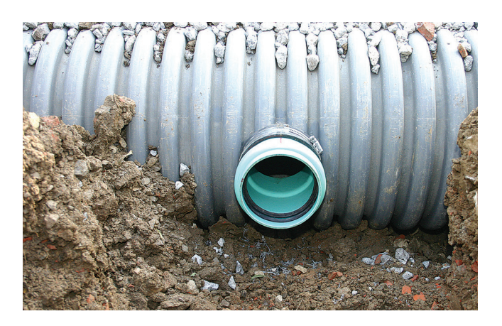
Typical Inserta Tee Tap