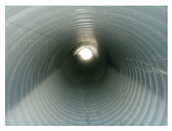
Smooth Interior Wall