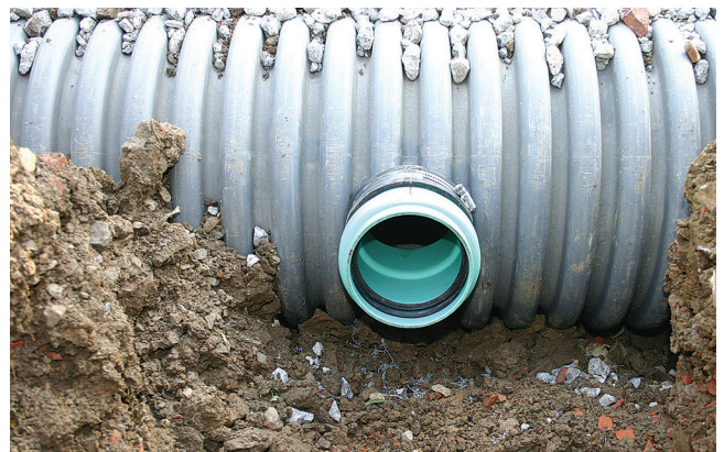
Typical Inserta Tee Tap