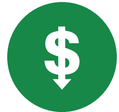
Lowest Installed Cost