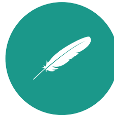
Light Weight: 1/20 the weight of Class III RCP