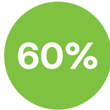
Reduction of Joints