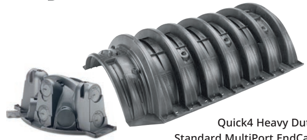
Quick4 Heavy Duty Standard MultiPort EndCap

The heavy duty structural design of the Quick4 HD Standard Chamber will support non-commercial vehicular traffic loads*. Patent-pending Quick4 HD Standard Chamber fits in a 36" wide trench and is ideal for curved or straight systems. The Contour Swivel Connection™ permits 10° turns, right or left. MultiPort endcap allows multiple piping options and eliminates pipe fittings.