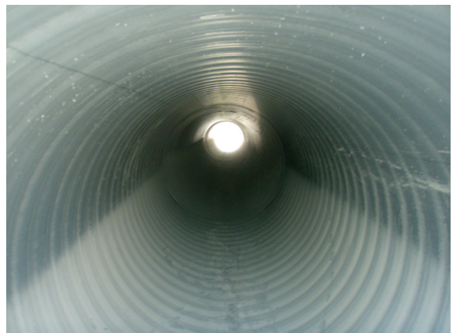
Smooth Interior Wall