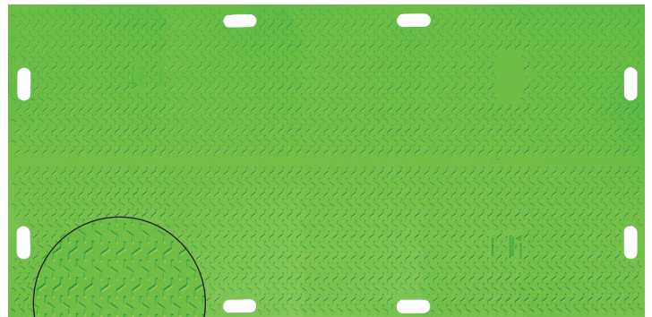
BAM! Pedestrian Side