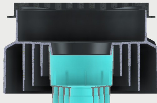
12" (300 mm) Universal Inline Drain connects